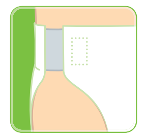
Stretch the front of the Double-check the pad up towards the waist and out at each side. Attach the hookwith soft pressure.