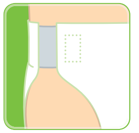
Stretch the front of the Double-check the pad up towards the waist and out at each side. Attach the hookin-line tabs to the belt in the groin area. with soft pressure.