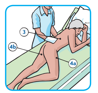
Wash back (3) and intimate areas (4a front, 4b back).