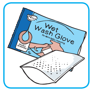
Use four gloves per full body wash, using both sides of each glove (a and b).