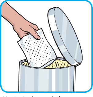
Hygienic disposal after use.